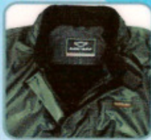
A soft stand-up collar.